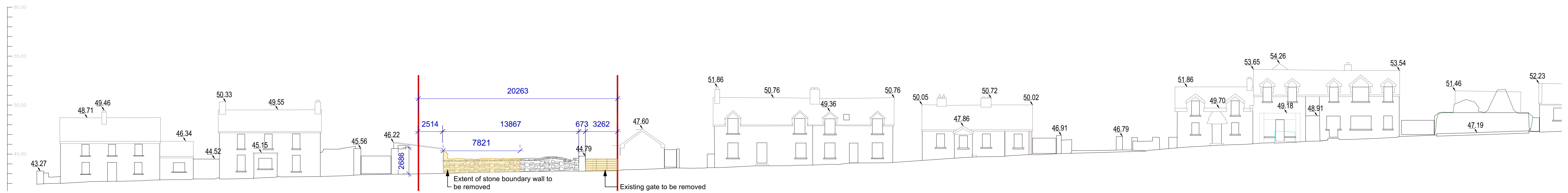
1 Car park street elevation 1 Scale: 1:200